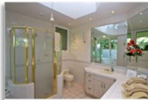
All bathroom surfaces, fixtures, and tile & grout