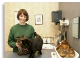
Veterinary clinics and animal rescue centers

In all cleaning situations, you will know if 2-ounces or 4-ounces will work best. Two-ounces is considered general purpose and the 4-ounce mixture is considered professional strength.