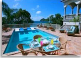
Outdoor – All stone, patios, marble and brick surfaces