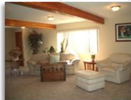
All fabrics, furniture and carpeting (stains & odors)