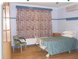
Nursing homes and wellness facilities