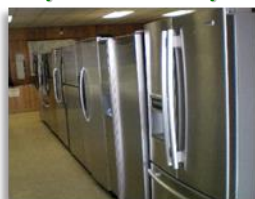
Stainless Steel Appliances