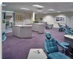
Hospitals, clinics and dental facilities