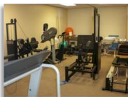
Physical therapy and fitness centers