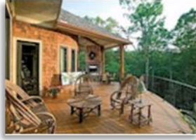
Mold & mildew stain on vinyl, wood, aluminum surfaces