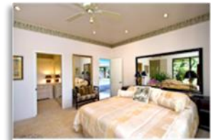
Bedroom linens, bedding and all other washable surfaces

Mix 2 ounces of ZymeAway concentrate into 1-gallon of water. Pour this mixture into a handy spray bottle and clean surfaces in the following manner.