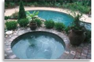
Hot tubs and spa cleaning and other washable surfaces

Mix 4 ounces of ZymeAway concentrate into 1-gallon of water. Pour this mixture into a sprayer and spray mixture over mold, mildew, or other organic dirt and debris. Use a long handled brush (soft to medium bristle) and brush mixture into the surface and allow it to penetrate into the debris for up to 5-minutes.