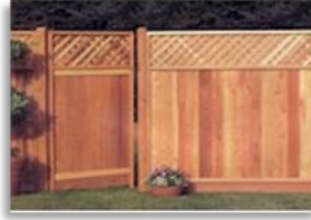
Cleaning wood, decks, siding and other washable surfaces