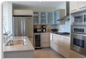
All kitchen surfaces, appliances and flooring